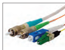
Compatible with Lynx-CustomFit™ Splice-on Connector