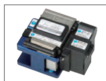
Table-top cleaver FC-6 / FC-6R series