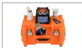
Carrying case with worktable CC-82