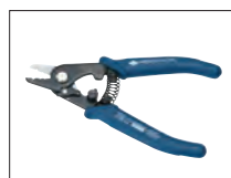
Jacket remover JR-M03