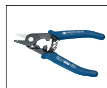
Jacket remover JR-M03