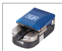
Handy cleaver FC-8R series