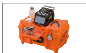
Carrying case with worktable CC-82