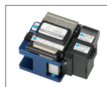
Table-top cleaver FC-6 / FC-6R series